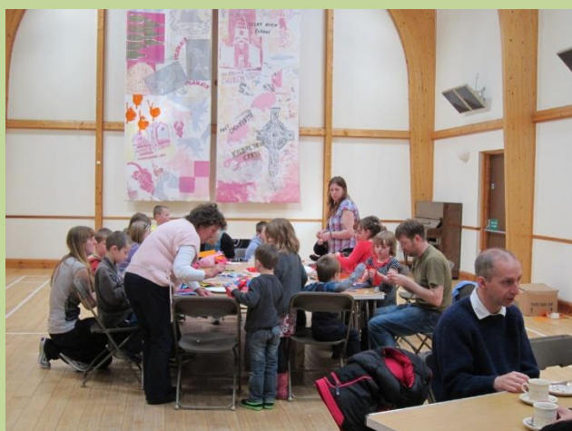
Puppet Workshop, Ballygrant Hall

The local primary school children hold their Harvest and Christmas Assemblies in the church and the minister is a frequent visitor to the school.